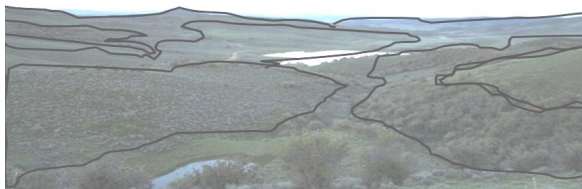
Figure 5. Rangeland Depicting Different Types of Land Based on Visual Clues in Aspect, Topography and Vegetation.

In the field it is often possible to identify different types of land just by looking at variation in vegetation and site characteristics (Figure 5). This gives you a general sense of the types of land, but in order to identify the ecological site of interest, it is necessary to gather a few additional resources. You will need to consider the topography, soils and plants on a site (see Box 3). Since different ecological sites have different characteristics and potentials, it is important to follow these steps in order to make sure that you correctly identify the ecological site of interest.