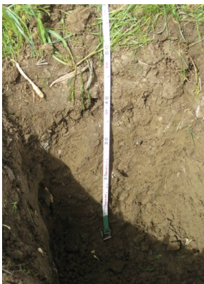
Figure 2. Claypan Ecological Site