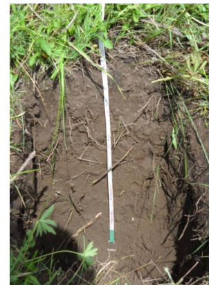
Figure 3. Mountain Loam Ecological Site